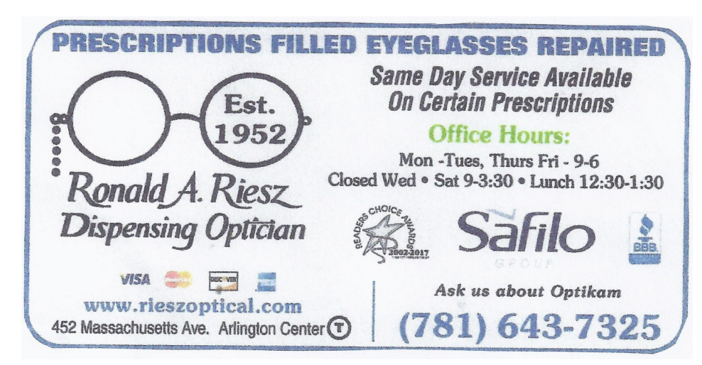
10% off for LWVA members and their families