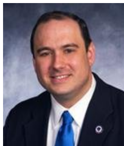
Senator James Eldridge On corporate political responsibility